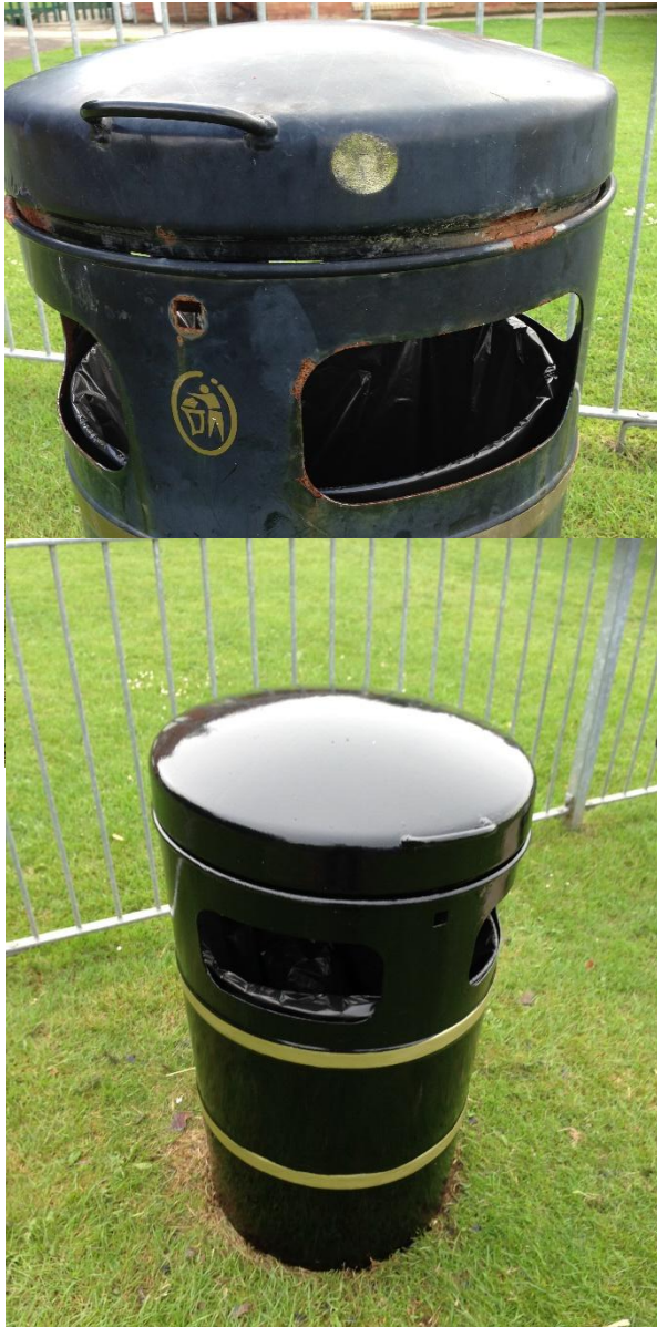
Newly painted facias